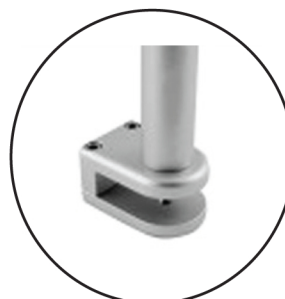
small edge clamp